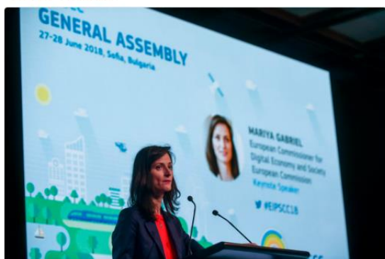
Mariya Gabriel and DigitalSingleMarket

"Becoming a smart city is not a goal in itself, but a means to respond more effectively and dynamically to the needs and desires of the citizens and ultimately improve the quality of their life." - Commissioner Mariya Gabriel #EIPSCC18 #EUDigital #SmartCities